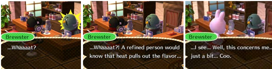
Figure 3: Brewster reacting to players wanting to wait for the coffee to cool.

The game contains another type of agency limitation as well: the one of presenting fake choices during interactions. A specific example of this can be found in interactions with one of the game's store owners: the pigeon barista, Brewster, in the village's coffee shop. The player can, once per day, order a cup of coffee from Brewster. Upon receiving the cup of coffee, the player is given two dialogue choices: immediately drink the coffee, or let it cool off a bit. The second choice, however, only leads to a dialogue where Brewster becomes upset and lectures or insults the player for not knowing how to drink coffee properly (see Figure 3). This dialogue is repeated infinitely if the second choice is chosen multiple times. Brewster's slightly overzealous reaction to the seemingly innocuous choice of letting your coffee cool down is another example of blind agency, but it is also one of agency limitation. The player is seemingly given options, but only one will allow them to further the interaction and they are trapped in an infinite loop of dialogue until they acquiesce and chug a cup of scalding hot coffee (as graphically represented by steam rising from the cup).